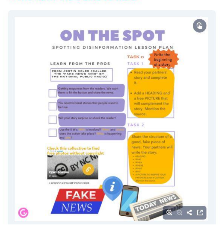
Step 3: Coming up with the news

Teachers ask students, in international teams, to come up with news stories in two different ways. Firstly, students from one school start a story and another team from a different school finishes it, proposes a title and adds a photograph using a copyright-free image resource bank. Secondly, all of the students from one of the participating schools proposes a headline, an outline of the news using the five "Ws" (Who, What, When, Where and Why) and a photograph that inspires the team in charge of narrating the story in the partner school.