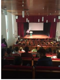
image 2- onsite lecture

Permission is requested to record the onsite talk to share it later with the rest of the partners. If the option of videoconference is used, everyone participates directly.