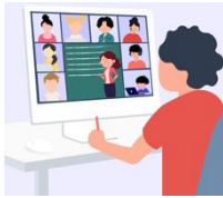
image 3- videoconference

REMEMBER: the videoconference should be scheduled in the TwinSpace, but it is also a good idea to have a plan B in case there are any last-minute technical problems. The backup platform should be designated jointly with the other partners (for example, Hangouts, Google meet, Jitsi, etc.).