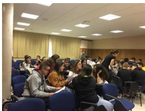
image 1- working in the classroom

Once everything related to the talk/workshop has been finalized, all participating students in the project work on making the most of the lecture (in each classroom-group), and they are provided them with the necessary information.